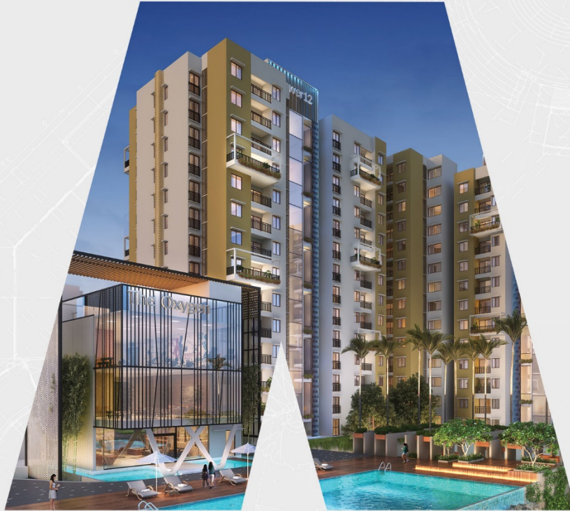
A PURAVANKARA HOME AT PURVA CELESTIAL